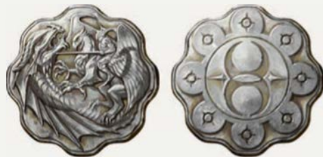
SUN PLATINUM COIN, TWICE AS LARGE AS A NIB (1 SUN = 1,000 NIBS)