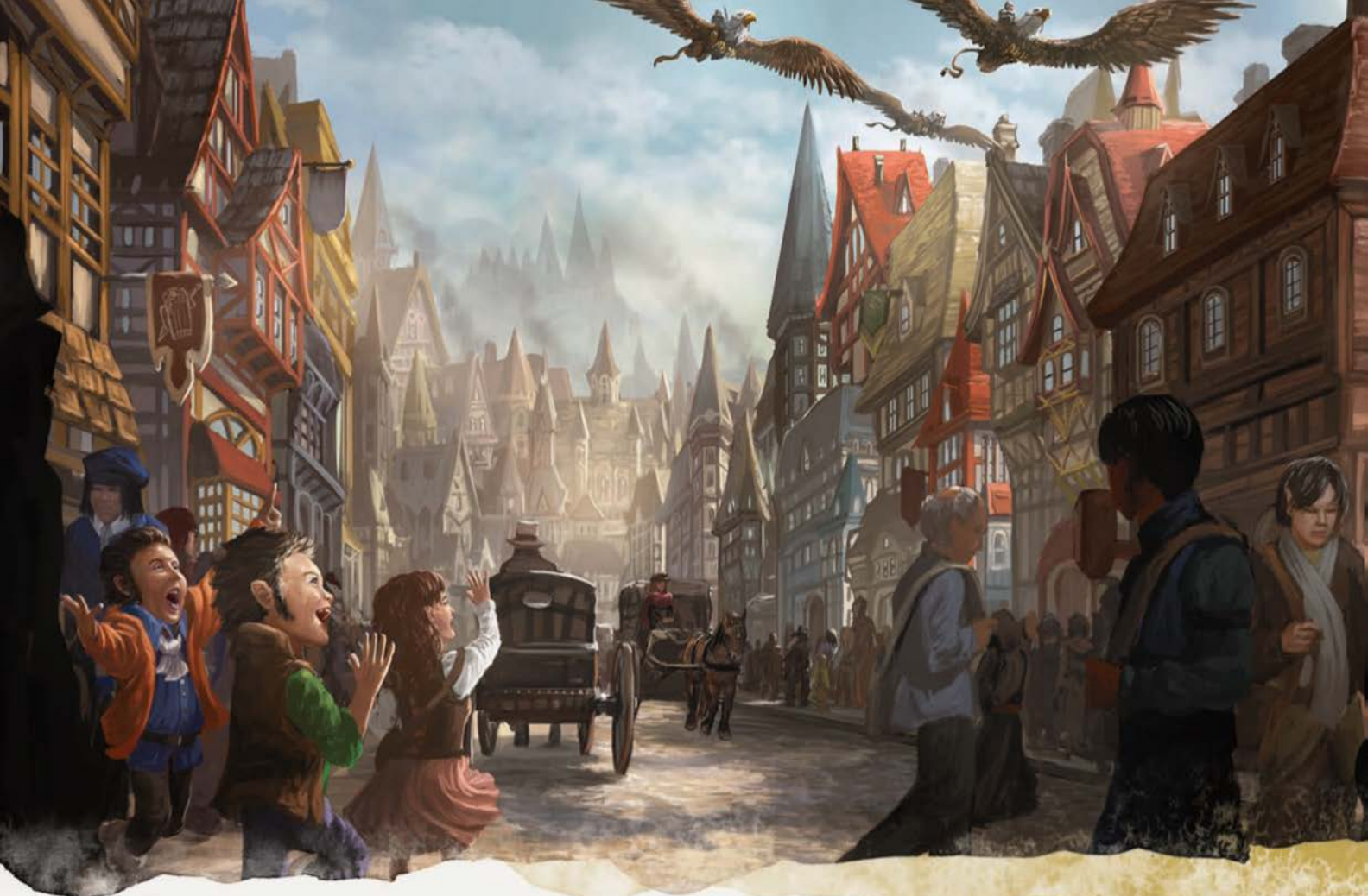
GRIFFON CAVALRY ON PATROL

near the largest city squares. In places without ready access to sewers or public outhouses, members of the Dungsweepers' Guild make multiple rounds each day, collecting urine and excrement separately—for use in industry and agriculture, respectively. Take comfort that in Waterdeep, you'll always find a pot to piss in.