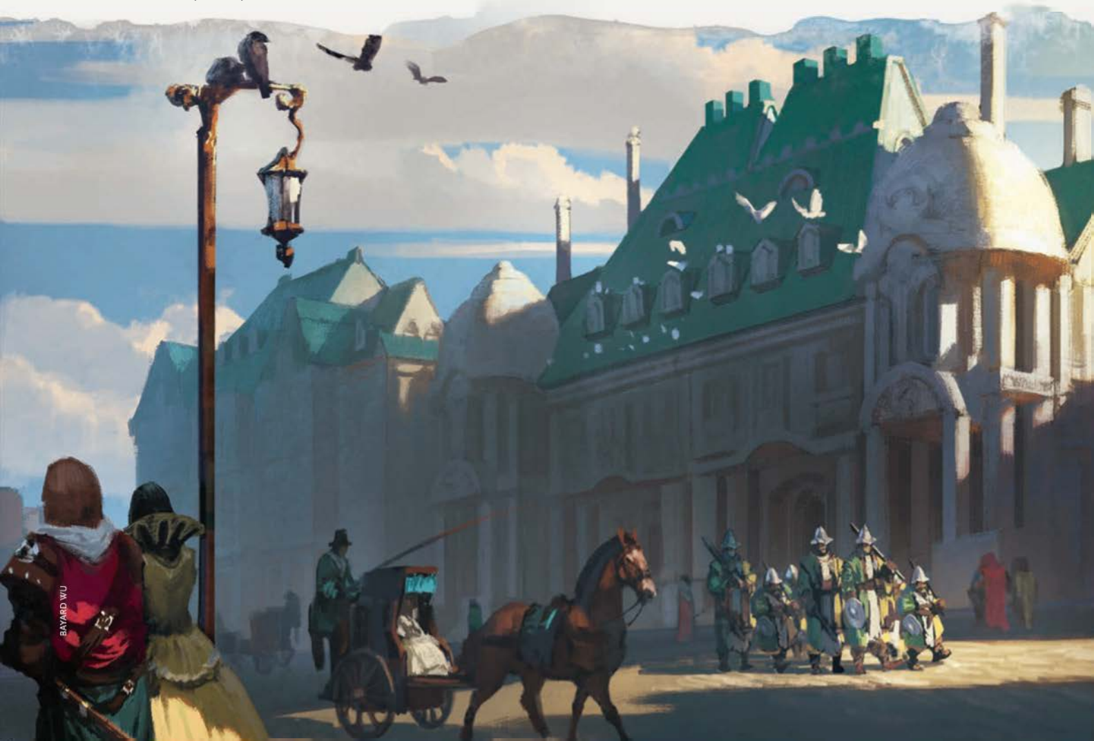
THE STATELY, CLEAN, AND WELL-DEFENDED CASTLE WARD

This ward bustles day and night with activity, both on the street and on balcony walkways that run the length of blocks and are sometimes layered five stories high. Shop signs appear to leap out from buildings, whose sides are plastered with advertisements all vying for the attention of the eye. Glove shops, shoe shops, jewelry stores, perfumeries, flower shops, cake shops, taverns, cafés, tea shops, inns, row houses, boarding schools, offices, dance academies, grocers, pottery stores, armor vendors—as long as it’s not illegal, you can find it in the Trades Ward. But if you are looking for something illegal, the Trades Ward is likely the place to get that too.