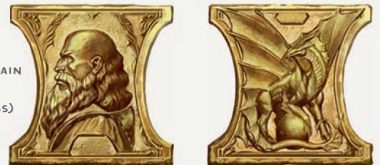
DRAGON GOLD COIN, HALF AGAIN AS LARGE AS A NIB (1 DRAGON = 100 NIBS)