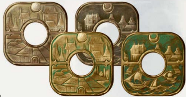
TAOL BRASS COIN, ABOUT TWO INCHES SQUARE WITH A HOLE LARGE ENOUGH FOR A NIB TO FIT IN (1 TAOL = 200 NIBS)