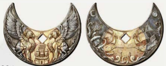
HARBOR MOON PLATINUM CRESCENT INSET WITH ELECTRUM, ABOUT THREE INCHES LONG WITH A HOLE LARGE ENOUGH FOR A NIB TO FIT IN (1 HARBOR MOON = 5,000 NIBS)