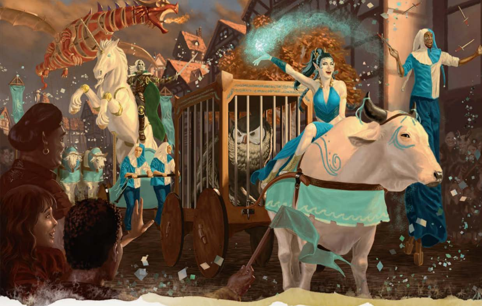
THE SEA MAIDENS FAIRE PARADE

But this fruitful alliance lasted less than the lifetime of a dwarf, for the emperor of the elves—what they call a “coronal”—commanded that all leave in the Retreat, that great exodus of elves from Faerûn to their mystical isle of Evermeet. Not all elves agreed with this edict, and many were determined to stay. Well, what emperor has ever willingly allowed another to sit in his throne? The coronal had all of Aelinthaldaar razed by magic, and the remaining elves splintered into separate kingdoms. The Melairkyn, of course, saw this as a breaking of their bargain, and never again did they deal with elves. Instead, they tunneled ever deeper under the mountain, never to be heard from again.