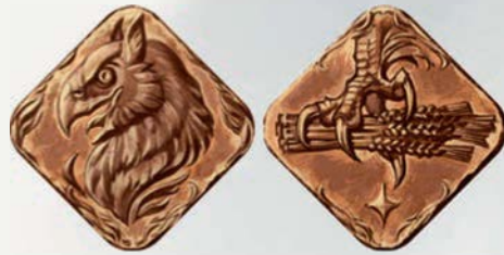
NIB COPPER COIN ABOUT THE SIZE OF A THUMBNAIL (1 NIB = 1 COMMON COPPER COIN)

HERE ARE IMAGES OF THE CITY'S COINS, WHICH AREN'T TO SCALE.