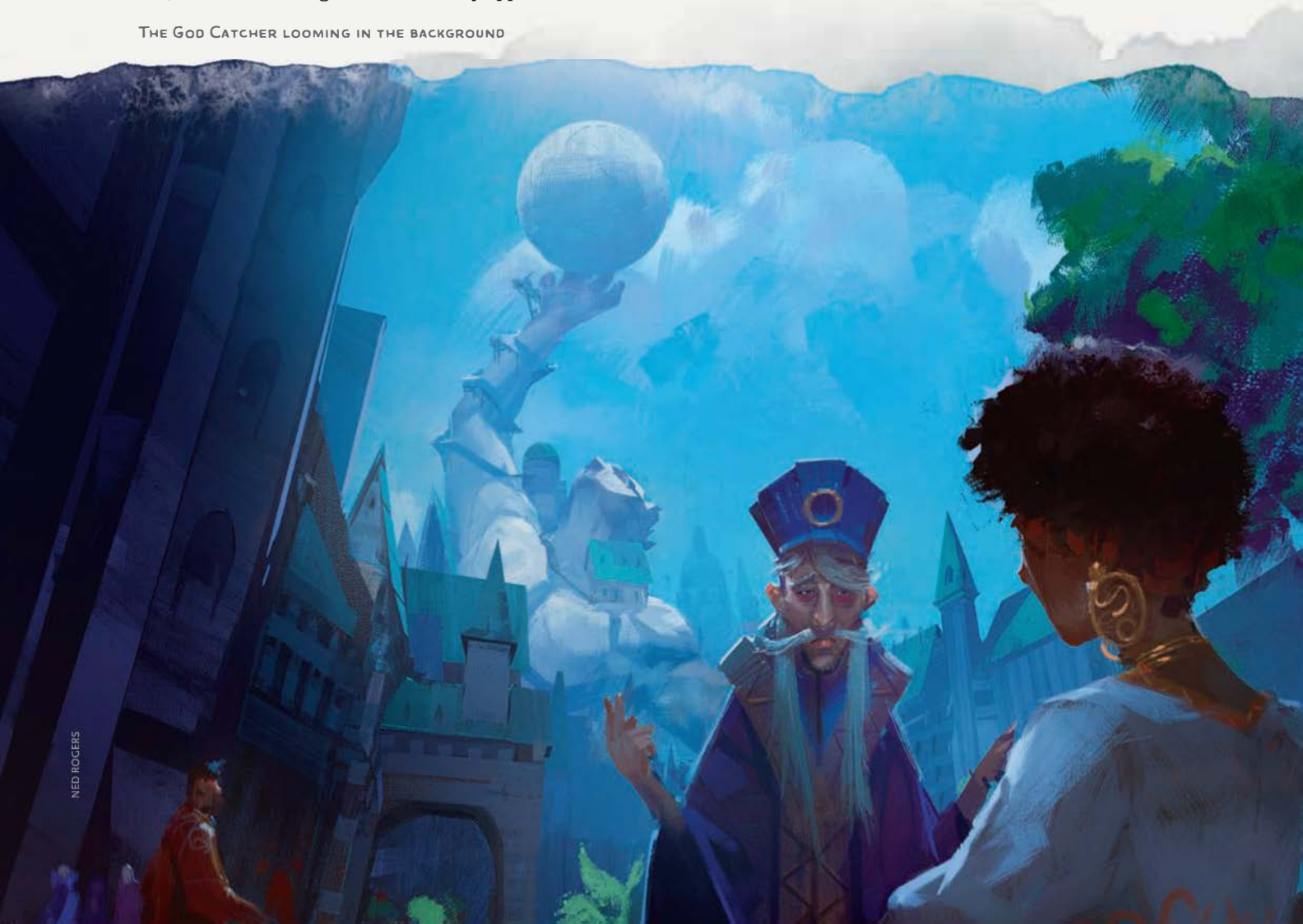
THE GOD CATCHER LOOMING IN THE BACKGROUND

This is perhaps the most famous walking statue in the city, thanks to its dramatic pose, its nearness to the Market, and the self-evident magic of its existence. The statue is of a well-muscled but impassive male human with its left leg sunk to the hip in the street, the result of a spell cast by the Blackstaff at the time of its rampage. Its left hand and right foot press against the ground as if it is trying to pull itself out. Its right arm is raised sky-