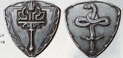
SHARD SILVER COIN, SLIGHTLY SMALLER THAN THE NIB (1 SHARD = 10 NIBS)